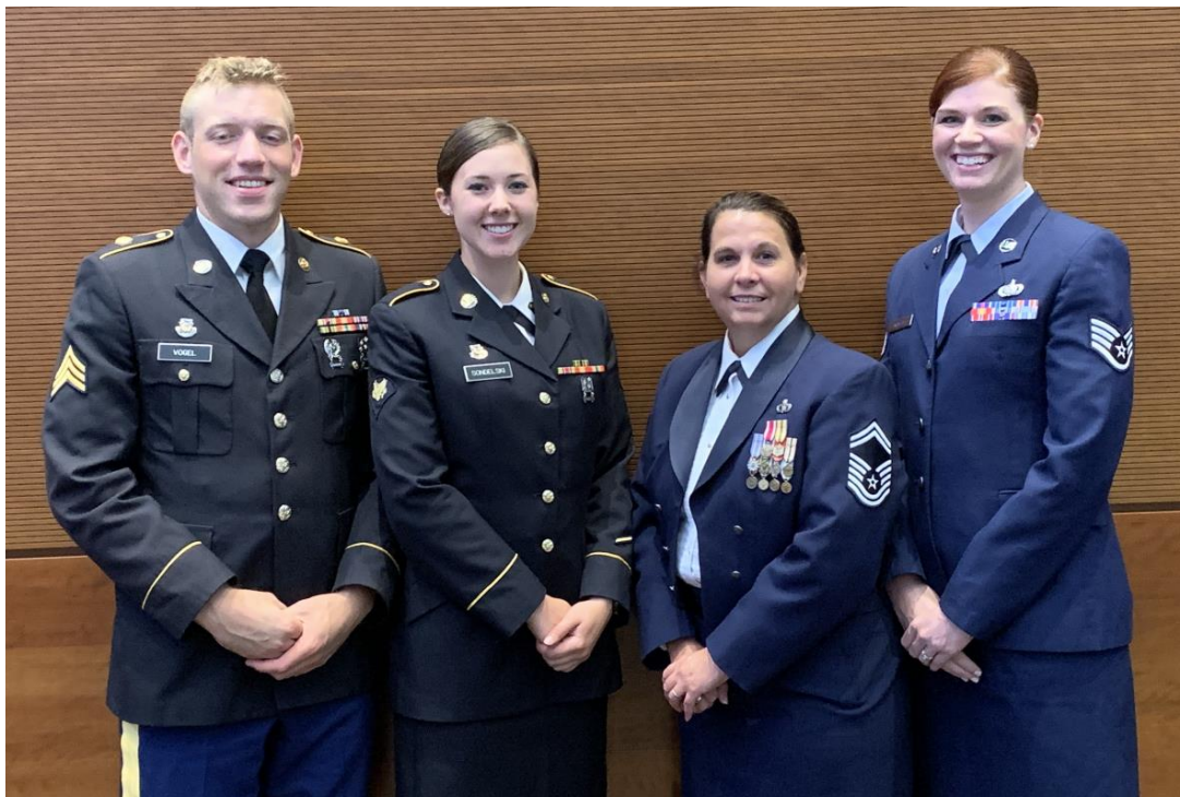
Professional Development attendees at 2019 EANGUS Conference in Des Moines, IA