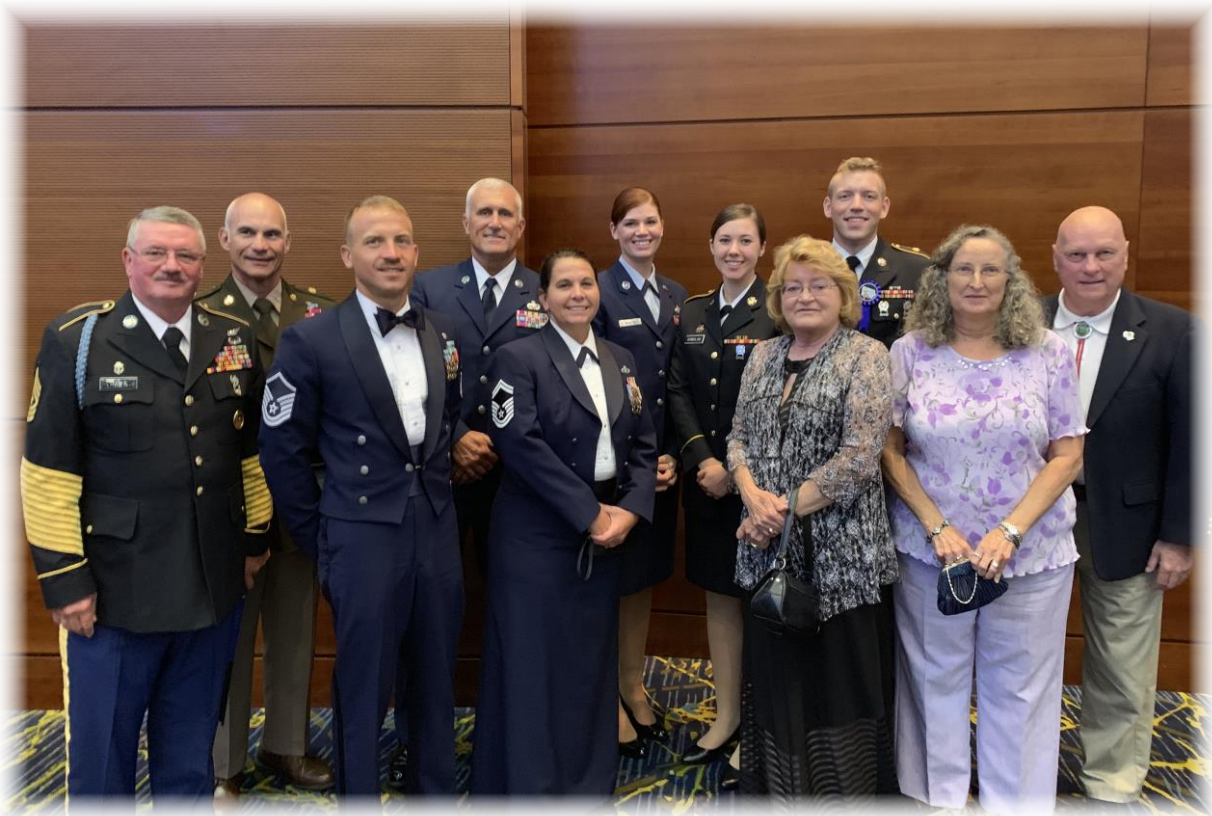
Wisconsin Delegates and Professional Development attendees at the 2019 EANGUS Conference in Des Moines, IA

47th Annual WNGEA Conference Photos and EANGUS National Conference Photos