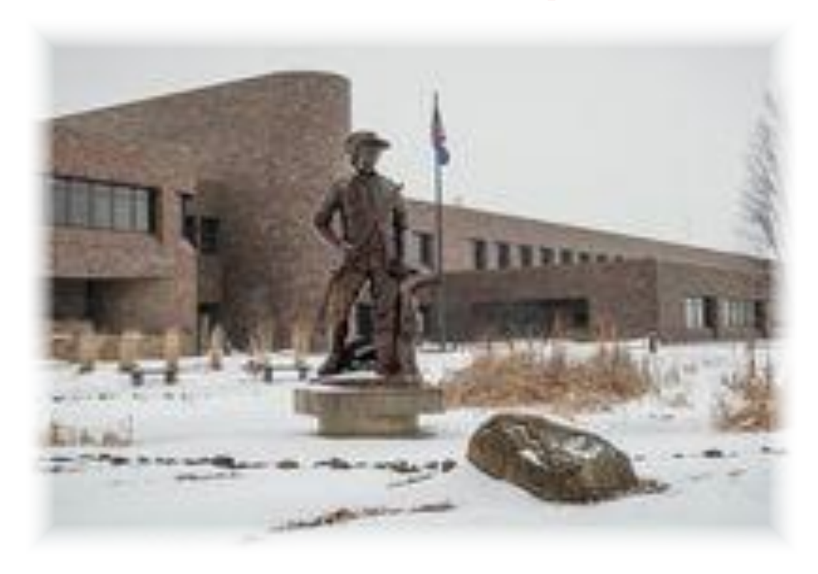
Check Out Scholarships